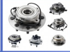
Wheel Hub Bearing